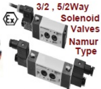
3/2 , 5/2Way Solenoid Valves Namur Type