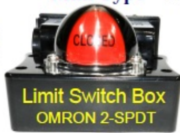
Limit Switch Box OMRON 2-SPDT