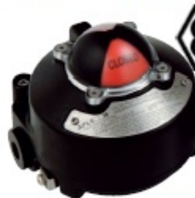
Explosion proof : Ex d IIB T6