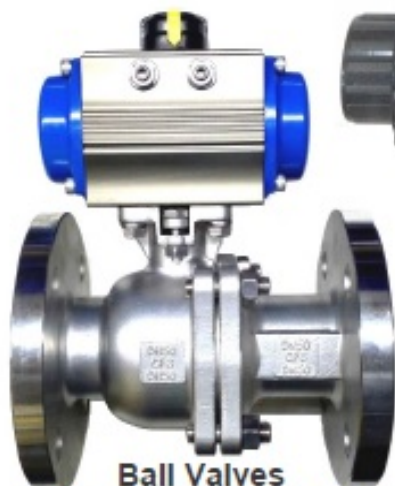
Ball Valves Soft Seat Or Metal Seat