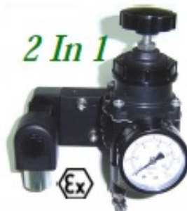
2 In 1

OMRON Made In Japan ENCLOSURE IP67 NEMA4 , 4X