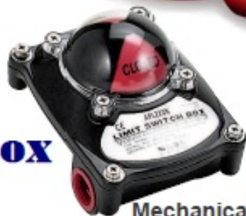
Mechanical Or Proximity

LIMIT SWITCH BOX Valve Position Monitor Weather proof