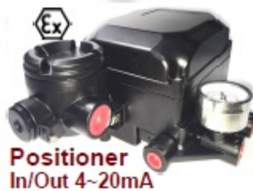
Positioner In/Out 4~20mA